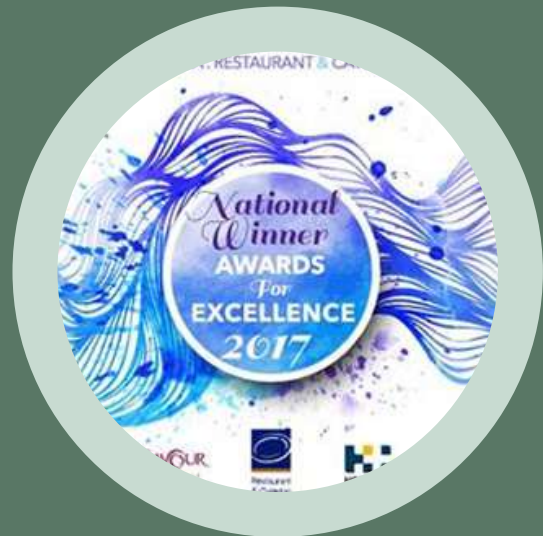
2017 Australian Small caterer of the year