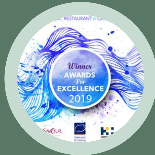
2019 West Australian Wedding caterer of the year