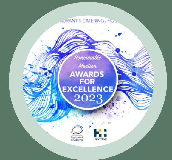
2023 West Australian Wedding caterer of the year