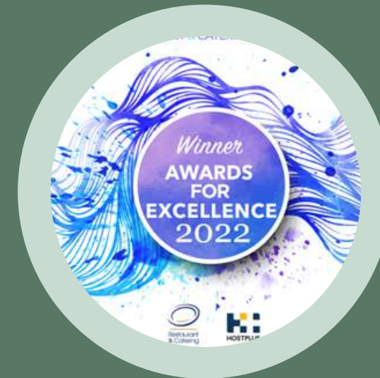
2022 West Australian Wedding caterer of the year