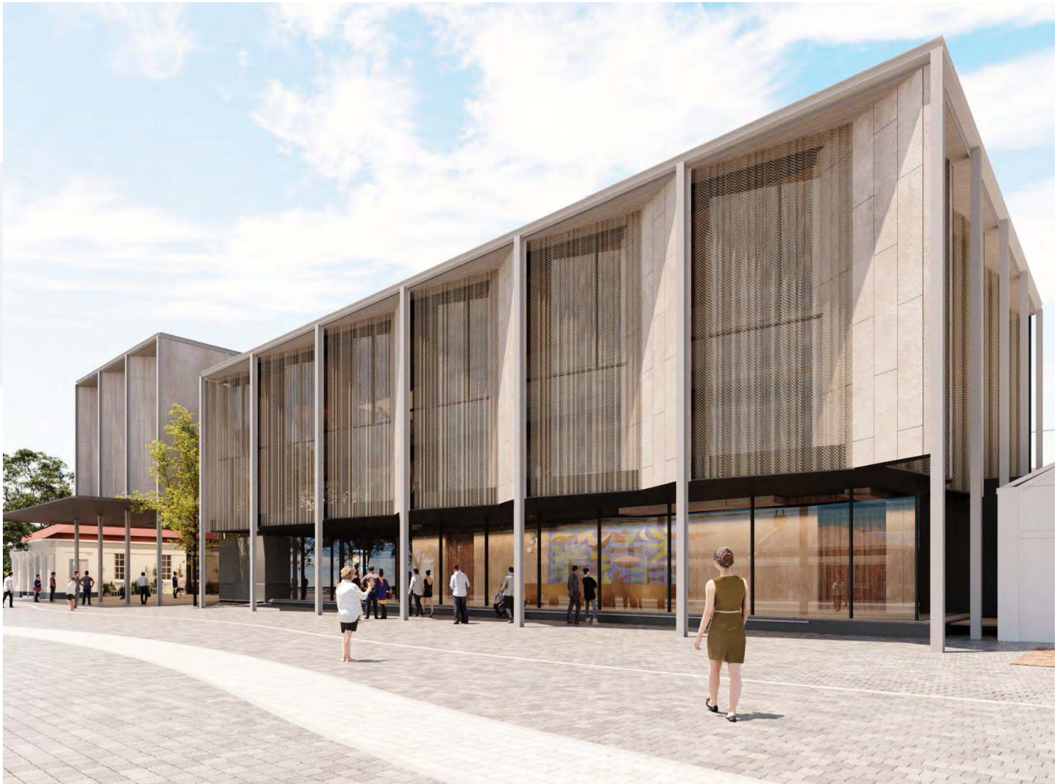
SALTWATER CONVENTION AND PERFORMING ARTS CENTRE